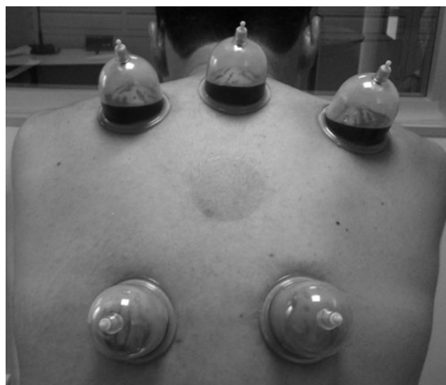
FIG. 2. A view after wet cupping.

Recording electrocardiography (ECG) was applied 1 hour before and 1 hour after cupping therapy. Participants rested for 10 minutes without recording ECG in order to stabilize autonomic parameters. ECG was performed by using PowerLab 26T (AD Instruments, Bella Vista, Australia), a device used for multimodal monitoring of bio-signals. According to the standard Einthoven triangle, three self-adhesive ECG electrodes were applied to the right wrist and right and left legs, respectively. The digital signals were then transferred to a laptop computer and analyzed by using LabChart® software (MLS310/7 HRV Module; AD Instruments). A full