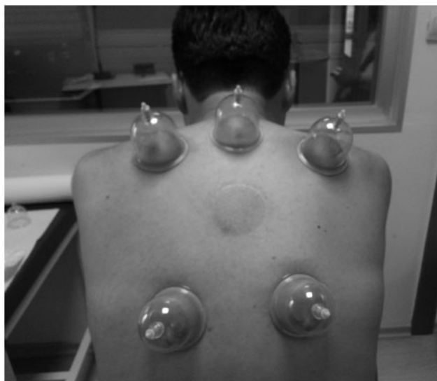
FIG. 1. Vacuum application before wet cupping.

All cupping procedures were applied by physicians certificated by the British Cupping Society and Natural Health Institute. For the cupping therapy, sterile disposable cups 5 cm in diameter were used. Five points of the posterior neck, bilateral perispinal areas of the neck, and thoracic spine were selected for treatment. These points are classic wet cupping points chosen for all cupping therapies (Figs. 1 and 2). Application areas were cleaned with antiseptic solutions. Cups were placed on these points, and negative pressure was applied by a cupping pump on the middle level. The cups were removed after 2 to 3 minutes. Then, the skin within the cupping sites was punctured to a 2-mm depth by using a 26-gauge disposable lancet. Then, pumping with vacuum was applied three times and 3 to 5 mL of blood was drained per cupping site. This method was suggested by the