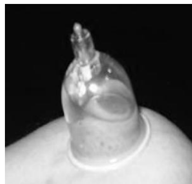
Fig. 2. Water cupping

Water cupping is done by using warm water inside the cup during cupping session. It involves filling a third of the cup with warm water. Whilst holding the cup close to the client with one hand, bring it close to the point to be cupped and insert burning cotton wool into the cup, then swiftly and simultaneously turn the cup onto the skin. When performed properly, no water spillage occurs [4]. (See Fig. 2) Water cupping is especially beneficial for treating asthma and related conditions including dry cough [25]. But certainly not in the acute stages of these diseases. Water spillage is the main disadvantage of this method.