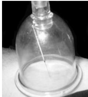
Fig. 1. Needle cupping

cup is applied over it. Usually, they use special technique to protect skin from burning by using a thin aluminum layer under the hot Moxa. Moxa is a dried Mugwort leaves used in Chinese medicine in a procedure called Moxibustion, a form of acupuncture. Observing patient during the procedure is very important because the patient is at risk of burn, which is the main disadvantage of this method.